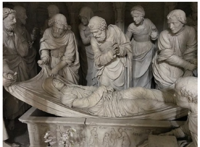
Sculpture of the Dormition of Our Lady at the Abbey of Solesmes