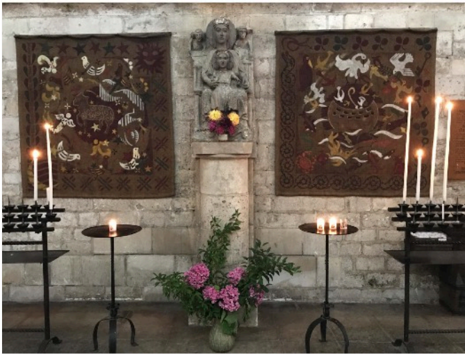
This venerated statue of Our Lady and Lord is from the 1100's. It is at the ancient abbey of Fontgombault. The tall candle at the left is burning for your intentions.